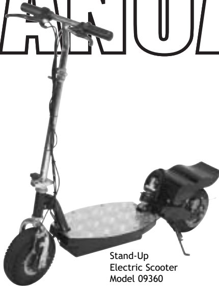
Stand-Up Electric Scooter Model 09360