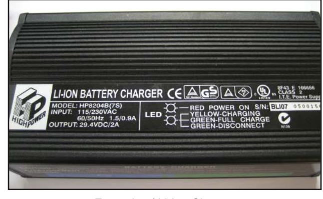
Example of Li-Ion Charger