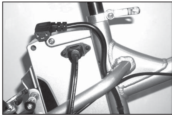
Electric Bikes with Seat Tube Mounted Battery (STB) Packs - Remove the power cable from the charger port and attach charger.