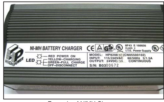
Example of NiMH Charger

Use only Currie Authorized NiMH chargers with bicycles equipped with NiMH batteries. Using any other charger will damage the batteries and void your warranty.