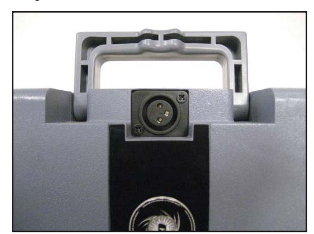
Electric Bikes with Rack Mounted Battery (RMB) Packs - Lift the battery pack handle to expose the charger port and attach charger.