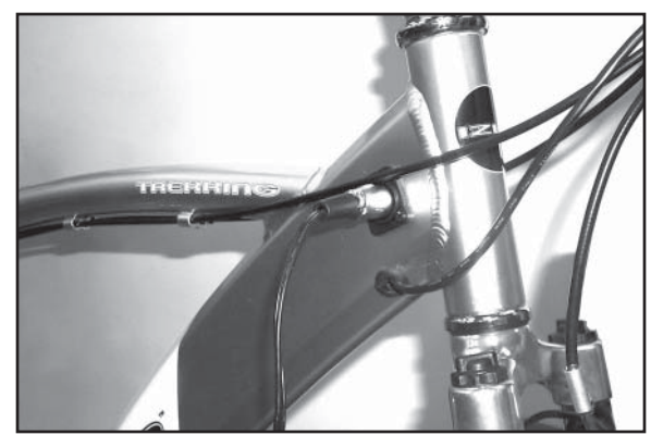
Electric Bikes with internal battery packs - Rotate the charger port cover and attach charger.