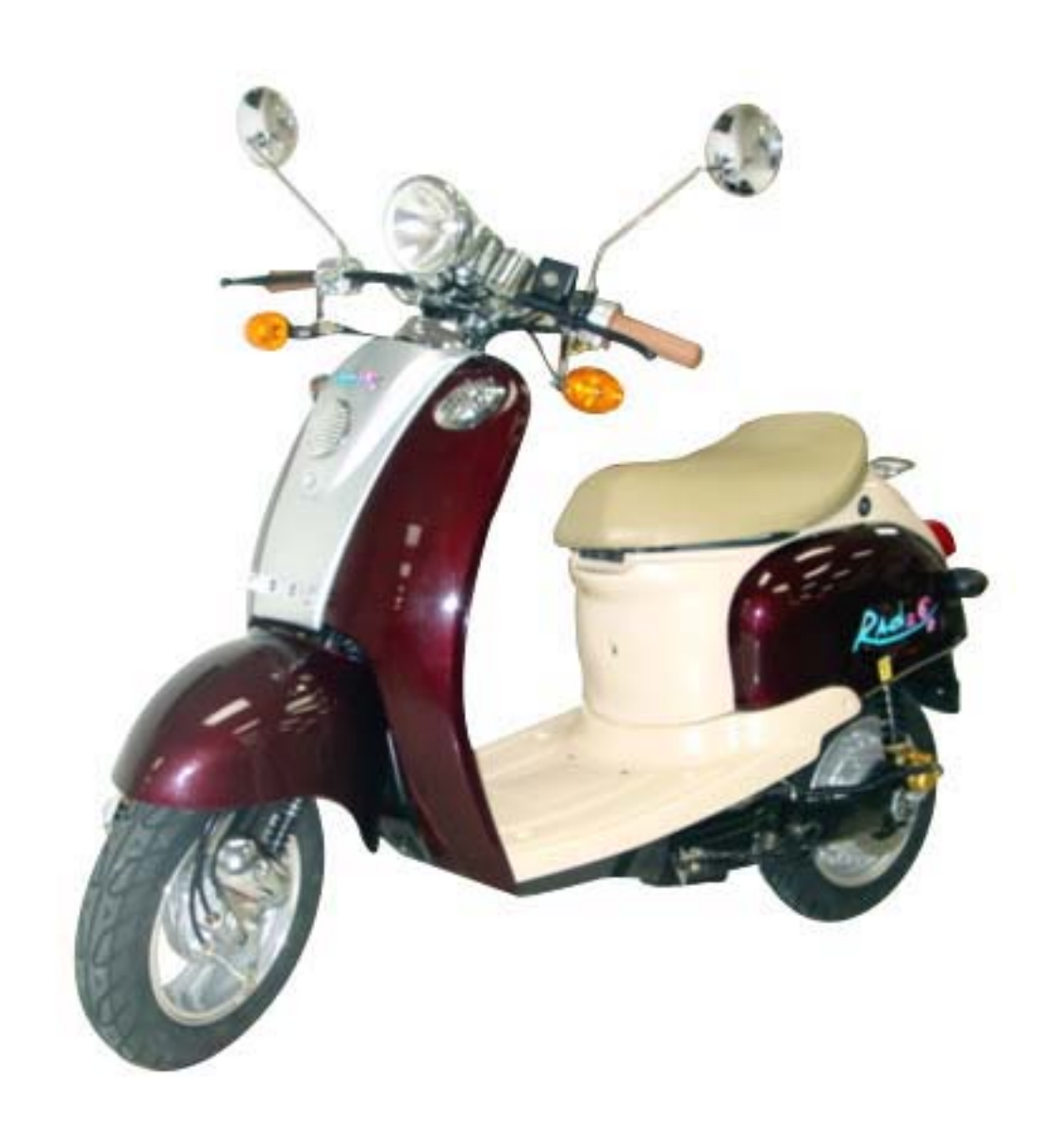
Mo Rad 1500