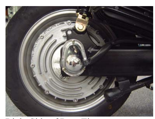
Right Side of Rear Tire