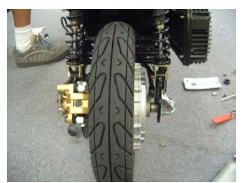
Full View of Rear Tire