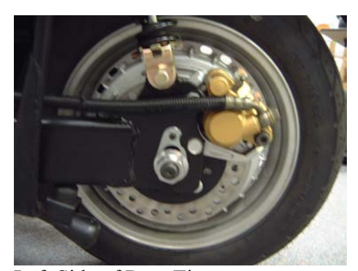
Left Side of Rear Tire