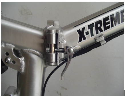
Step 3: Turn the clamp towards the front as Pic 7 shows.