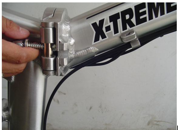
Step 2: Turn the clamp to the rear as shown in Pic 2.