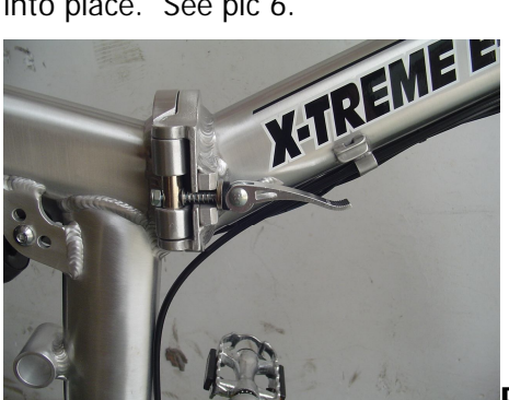
Step 2: Lift the spring to allow the folding mechanism to snap into place. See pic 6.