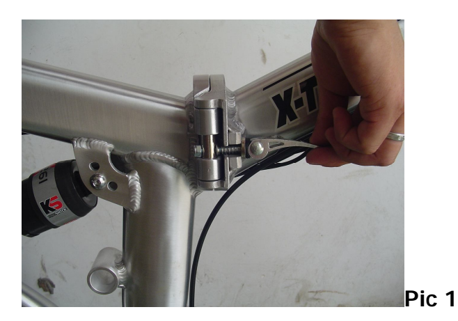
Step 1: Loosen the clamp as shown in Pic 1.